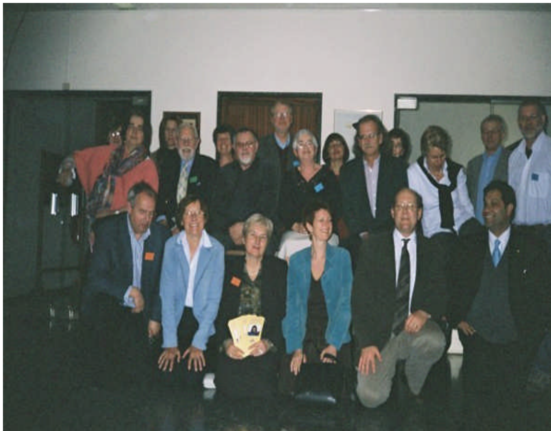
Delegates at the Presidents' General Assembly