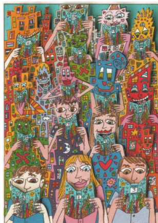
James Rizzi Artist

The Board of the EDA is delighted to announce that the famous American Artist, James Rizzi , has sponsored the European Dyslexia Association with a sizeable euro donation and the Board gladly reproduces one of his famous paintings of children reading. More pictures will be shown in future issues of EDA NEWS :