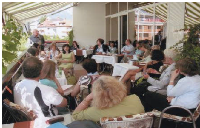
Some delegates in discussion at the Conference on Bled